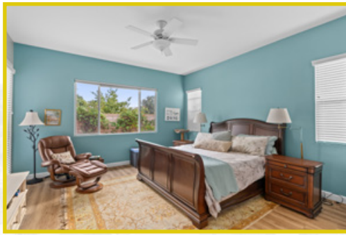
Master Bedroom w/Patio Access