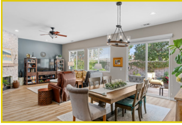
Open Concept Floor Plan w/Fireplace